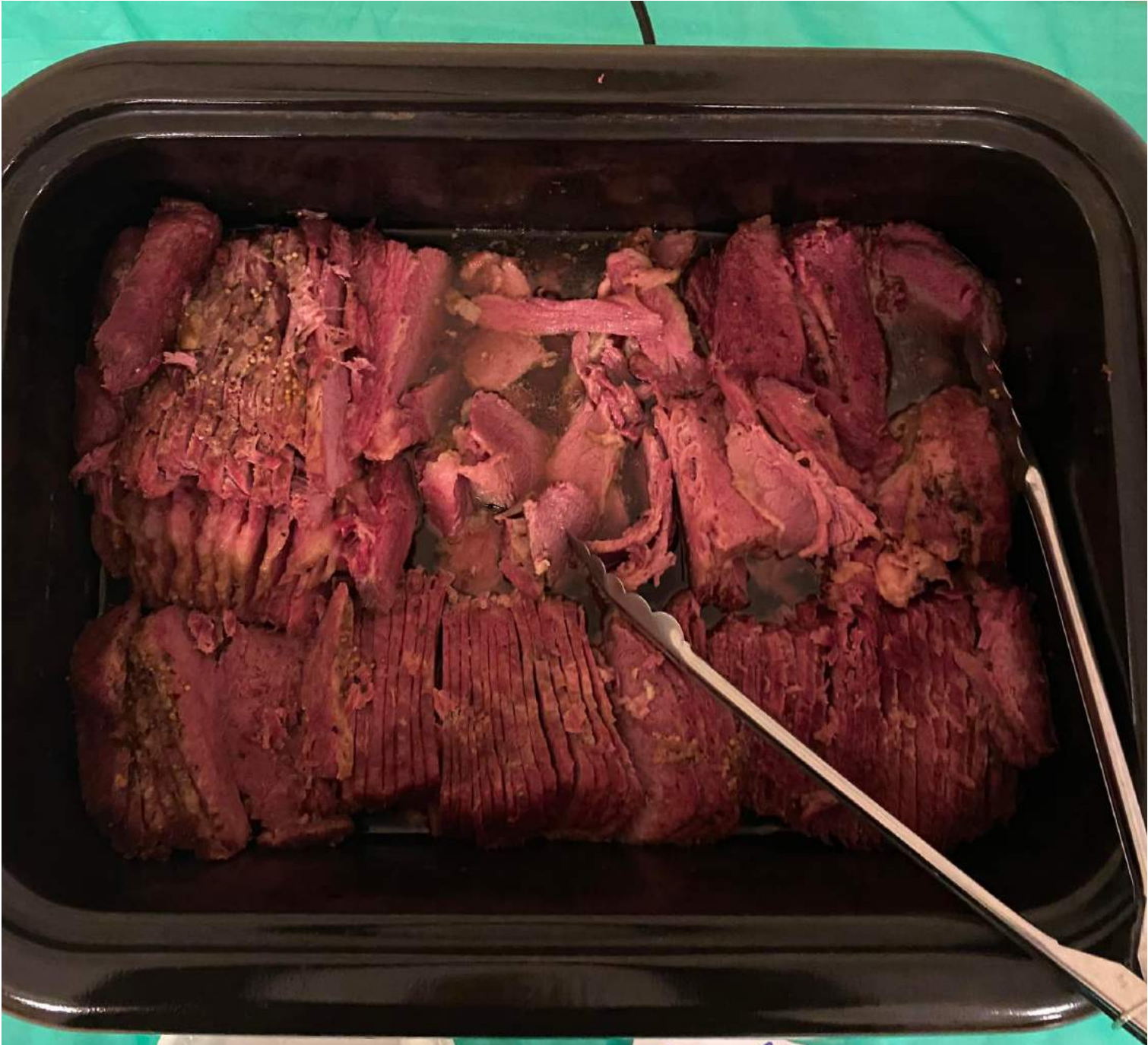
Corned Beef in Guinness