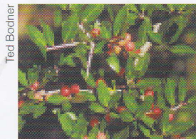
Dwarf yaupon Ilex vomitoria