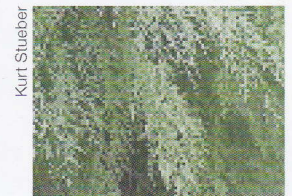
Leyland cypress Cupressocyparis leylandii