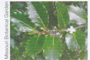
Missouri Botanical Garden Blue holly Ilex x meservea