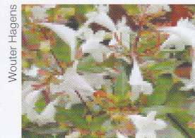
Wouter Hagens Glossy abelia Abelia x grandiflora