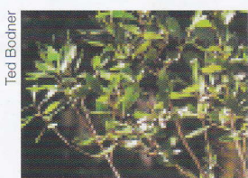
Gallberry Ilex glabra