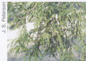
Chinese juniper Juniperus chinensis