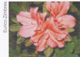
Eurico Zimbres Azalea Azalea obtusum