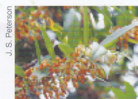
Pipstem Agarista populifolia