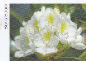
Boris Bauer Rhododendron Rhododendron x chionoides