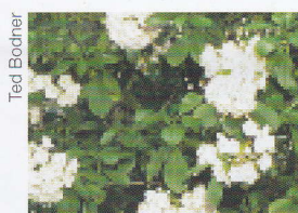
Mountain laurel Kalmia latifolia