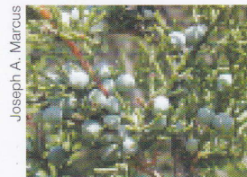
Ashe juniper Juniperus ashei

Plant these shrubs 30 feet or more away from the house. Maintain them regularly.