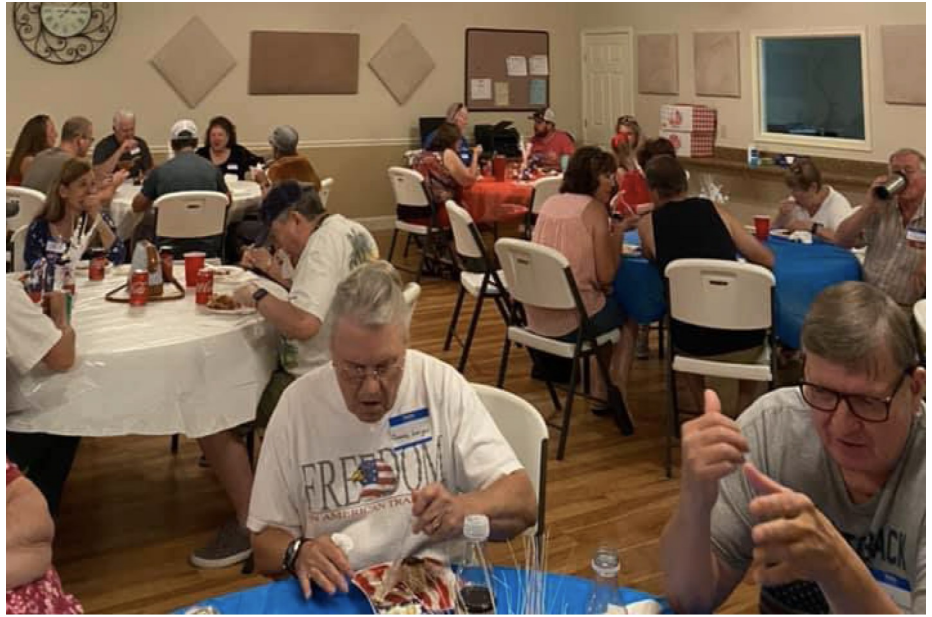
FOURTH OF JULY TABLE