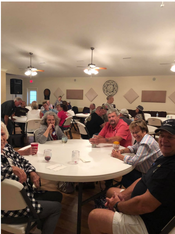
POT LUCK TABLE