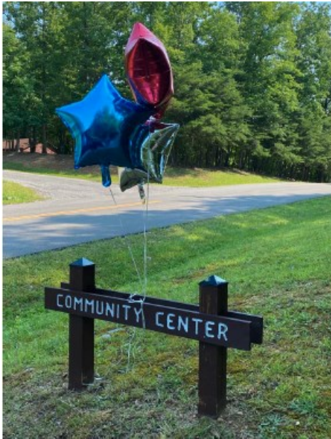
FOURTH OF JULY BALLOONS