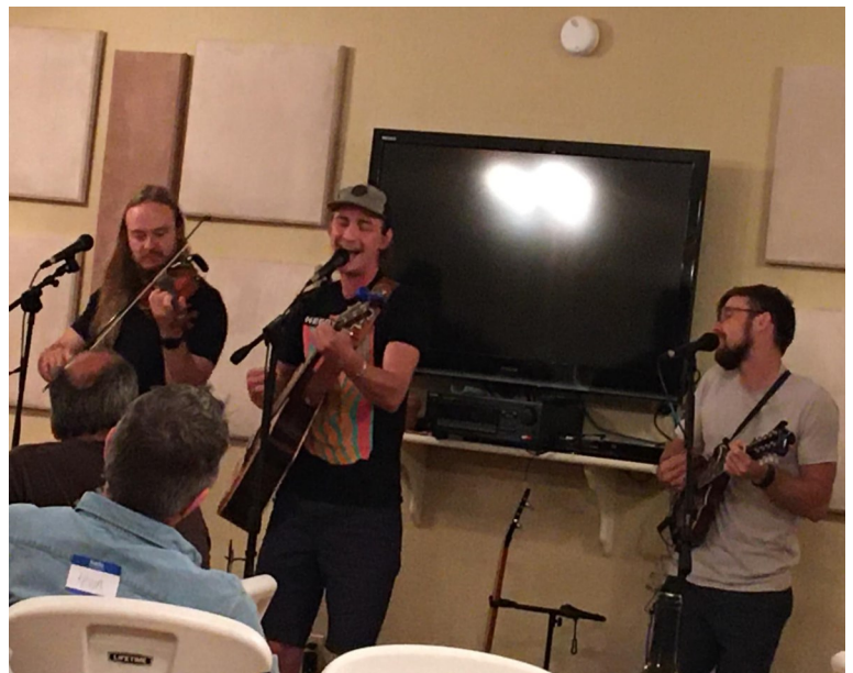
POT LUCK BAND